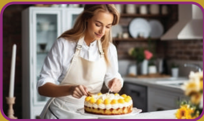
MASTER BAKER CHAMPIONSHIP