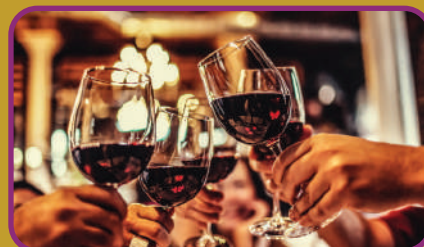
WINE TASTING WORKSHOP