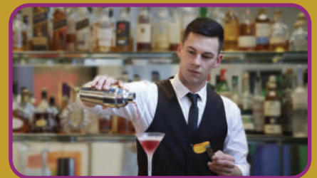
BEST BARTENDER CONTEST