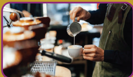
BEST BARISTA CHAMPIONSHIP