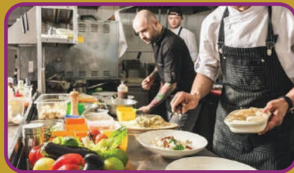
MASTER CHEF CHALLENGE